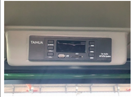
Digital Radio + MP3 Player