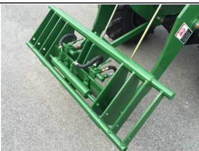
Euro Standard Quick Coupler