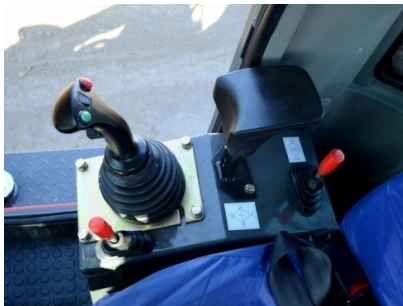
Color Coded Electronic Gear Shift Button on Joystick