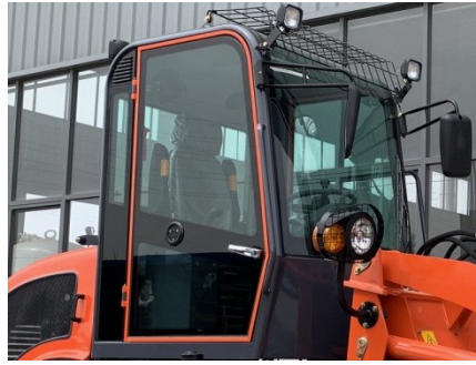
Enclosed Cabin (Newly Designed)