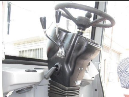
Mechanical Gear Shift Lever (Automatic Transmission)