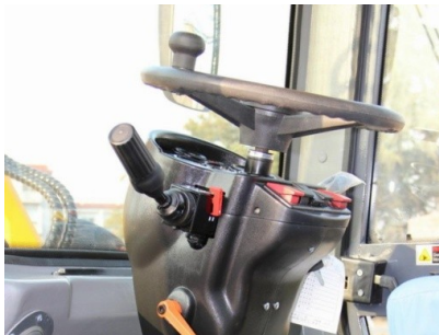
Gear Shift Lever with Electronic Control