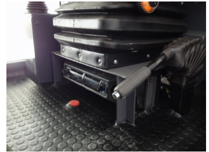
Air Conditioner (Some Models Only)