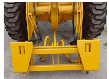
Skid Steer (Bobcat) Quick Coupler/Quick Attach/Quick Hitch