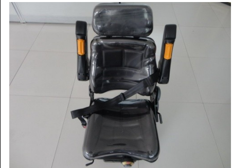
Adjustable Suspension Seat