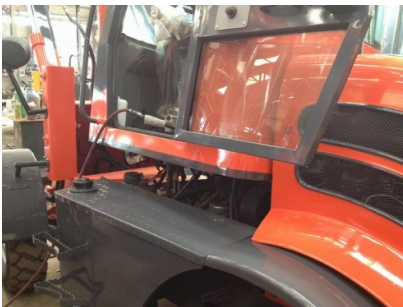
Tilting Cabin (up to 30° for Easy Maintenance)