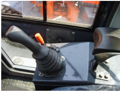
Hydraulic Joystick Control + Quick Hitch Lever + Armrest